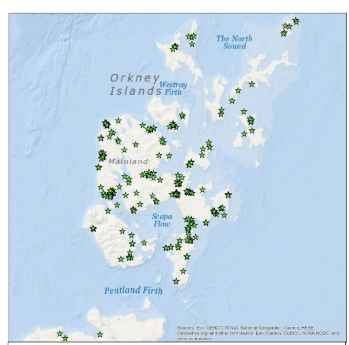
347 pins mark the facilities you use for marine and coastal recreation, as well as new facilities you would like to see.

Thank you to everybody who took the time to fill out the survey, we are looking forward to sharing the results once available.