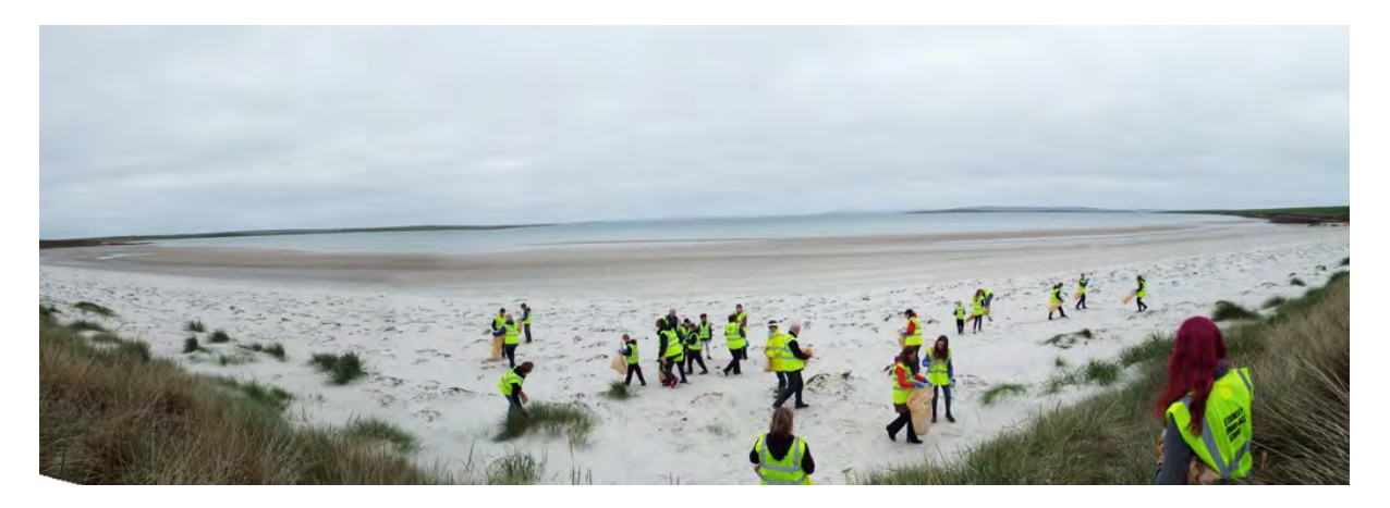
A Bag the Bruck event in Stronsay

Bag the Bruck is a voluntary clean-up of rubbish which is undertaken each spring on over 50 sites throughout the Orkney Islands, mostly on the islands' many beaches. This initiative aims to address the serious threat that marine litter presents to both wildlife and people. Until 2014 Bag the Bruck was organised by a local group, Environmental Concern Orkney; however, it has now been taken over by members of the Outdoor Orkney group. Orkney Islands Council has supported Bag the Bruck for many years through the provision of gloves and bags and also by collecting and disposing of the waste collected. Bag the Bruck 2020 had to be cancelled due to restrictions to address the Covid-19 pandemic.