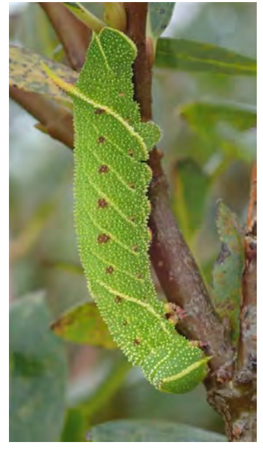
Pink Barred Sallow, Puss Moth and Poplar Hawkmoth Caterpillar: all images © Sydney Gauld