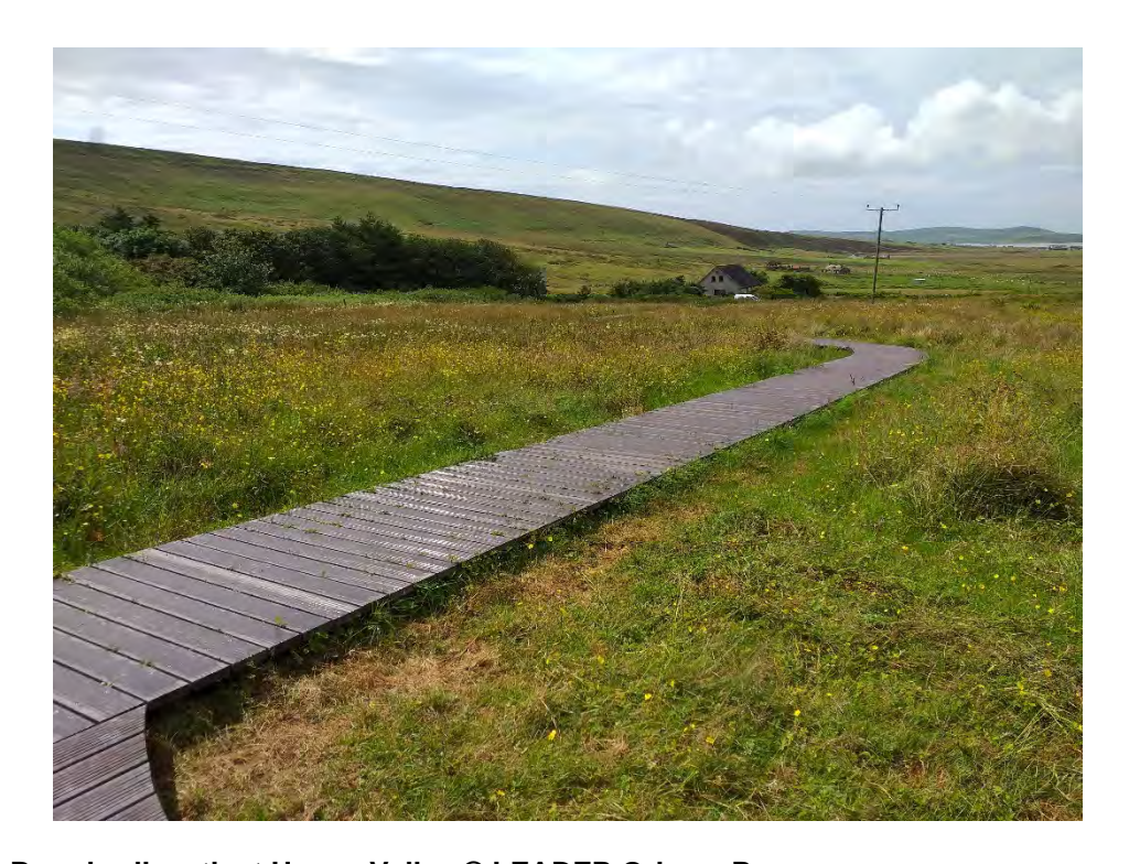
Boardwalk path at Happy Valley

The project was funded by the Scottish Government and the European Community Orkney LEADER 2014-2020 Programme; the Scottish Landfill Communities Fund and the Friends of Happy Valley.