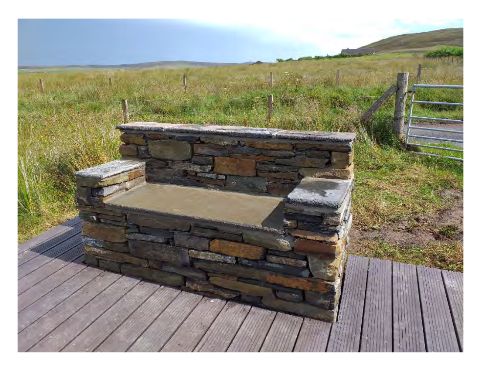
One of the new stone seats at Happy Valley