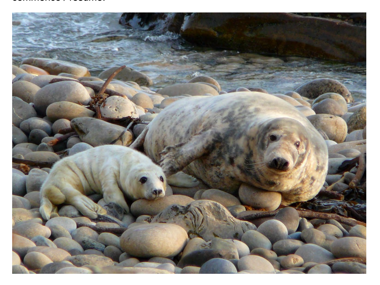
Grey seal and pup

people to get involved autonomously, until events and group activities can commence / resume.