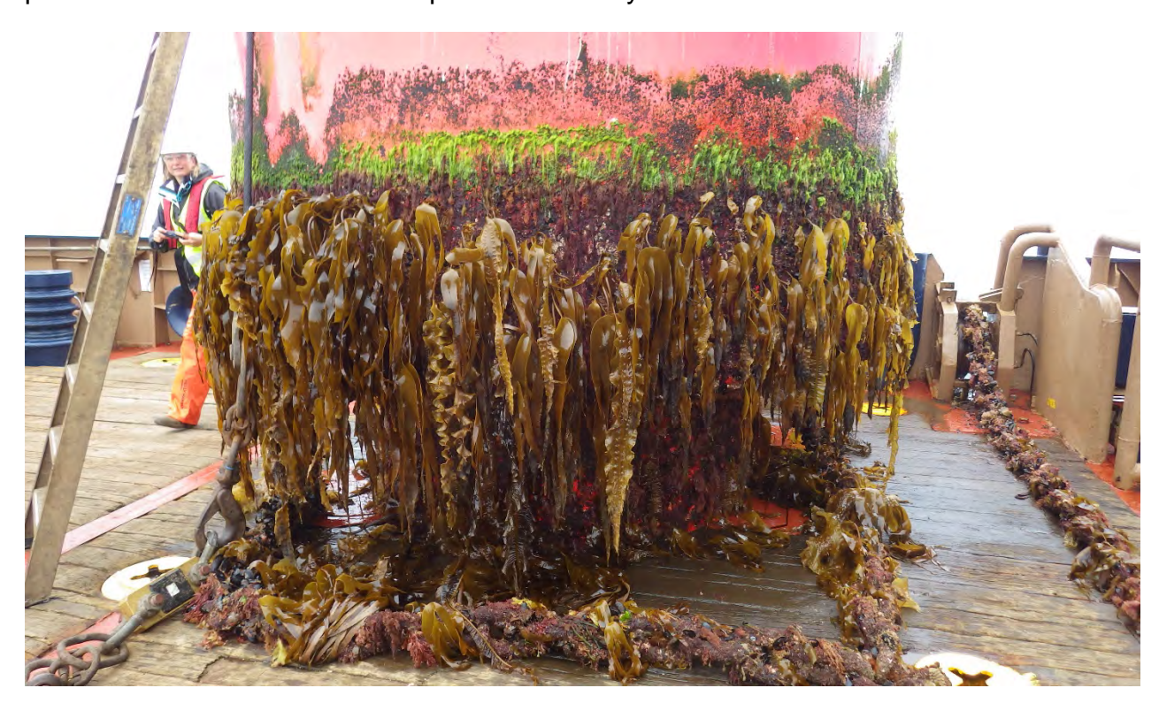
The Grinds navigation buoy

The Council's Ballast Water Management Policy for Scapa Flow allows for the discharge of exchanged and treated (if treatment facilities are fitted to the vessel) ballast from vessels within Scapa Flow, subject to adherence to strict conditions. An important part of the Policy is a monitoring and recording programme for the presence of non-native species which commenced in 2013 with a baseline study. As this is an inherent part of the approved policy, enabling the Council to fulfil its responsibilities under the Wildlife and Natural Environment (Scotland) Act 2011, the monitoring programme will proceed during future years. As an addition to the non-native species monitoring programme, scrape samples are routinely collected from visitor yacht moorings. This sampling provides further distributional data on the presence of marine non-native species in Orkney.