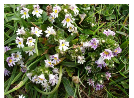
Bird's foot trefoil, Dog violet: both images © Sydney Gauld; Eyebright