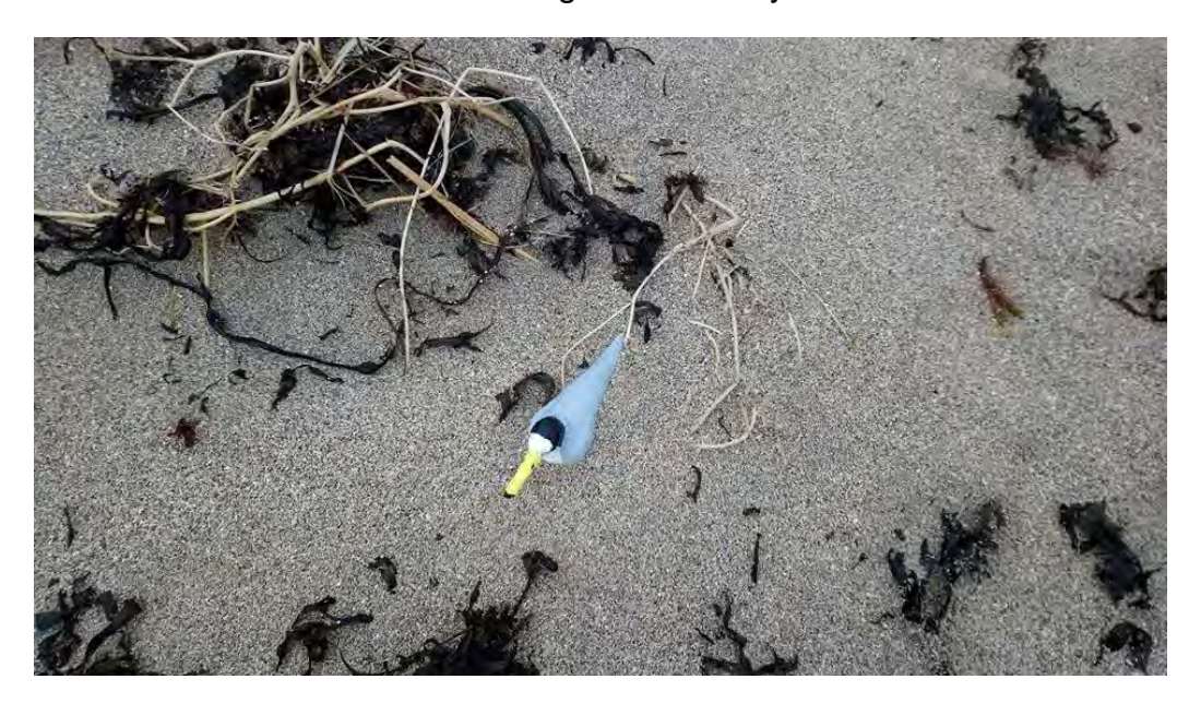
Little tern decoy

Restrictions in place to address the coronavirus pandemic meant that the project couldn't go ahead in 2020 and, unfortunately, no little terns are believed to have fledged from the site this year. In view of the success of this project, it is hoped that the schools will be able to be involved again in future years.