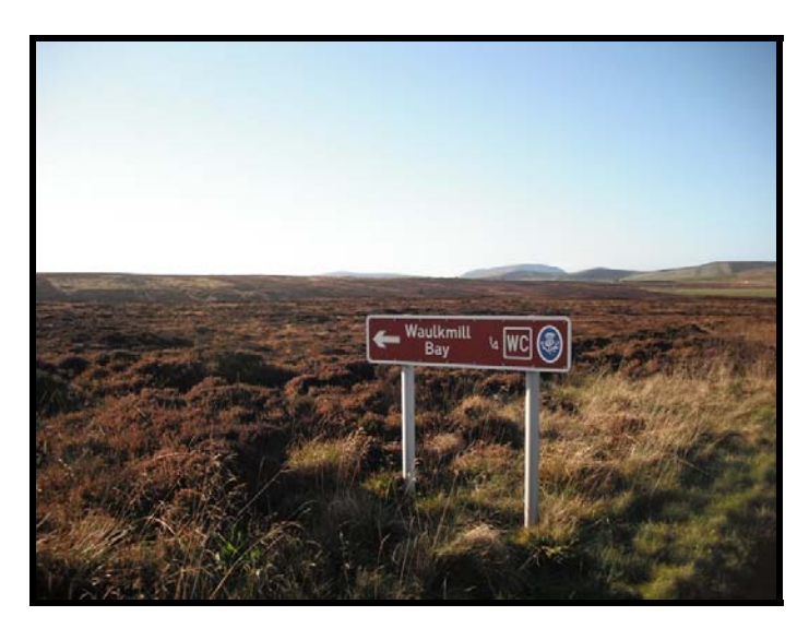
Signposting in sensitive areas of Orkney