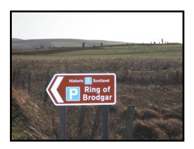
Tourist signposting in Orkney