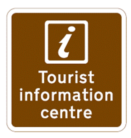
Signage that may be used for Tourist Information Centres