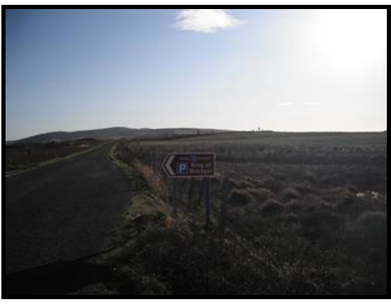
Tourist destination signposting in Orkney