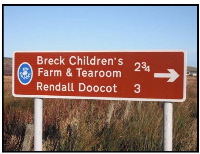
Examples of tourist sign symbols