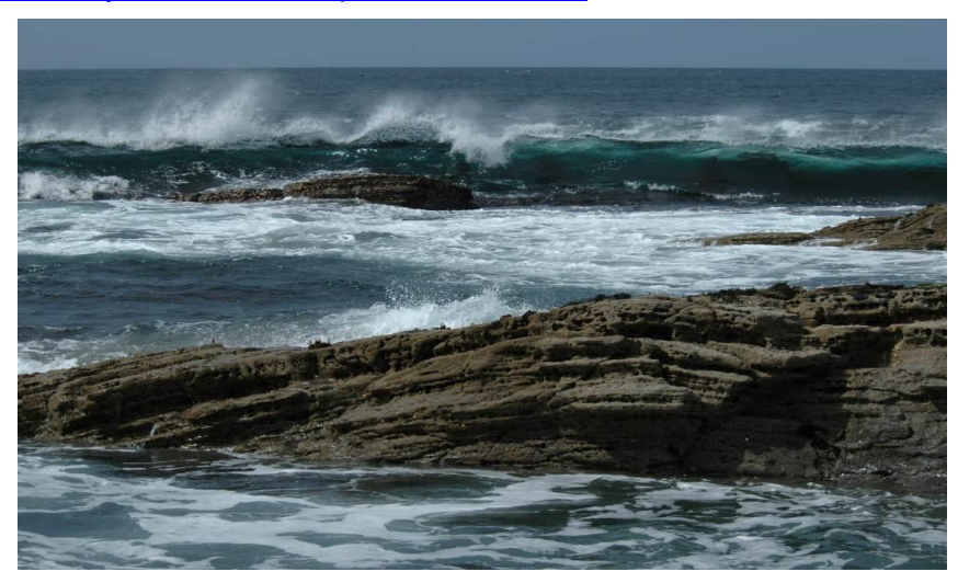
Waves Breaking

Orkney Local Development Plan <a href="http://www.orkney.gov.uk/Service-Directory/O/Orkney-Local-Development-Plan.htm">http://www.orkney.gov.uk/Service-Directory/O/Orkney-Local-Development-Plan.htm</a>