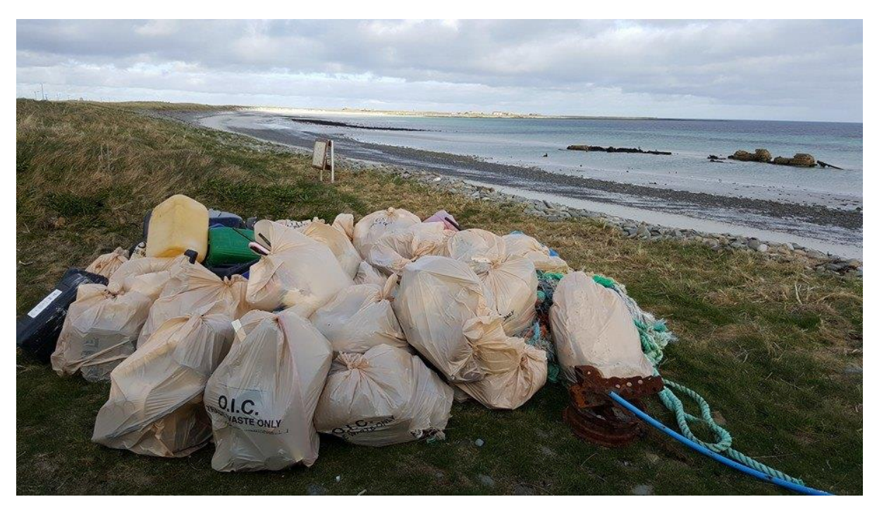
Bag the Bruck waste collected in Sanday

Bag the Bruck is a local clean-up initiative which takes place annually during April. Around 50 beaches and shorelines are targeted by over 1,000 volunteers and over a period of 9 days many tonnes of litter are collected, bagged and removed for disposal. Established in 1993 by Environmental Concern Orkney (ECO), Bag the Bruck is now administered by members of another local group, Outdoor Orkney. The Council lends its support by picking up and disposing of the waste that is collected.