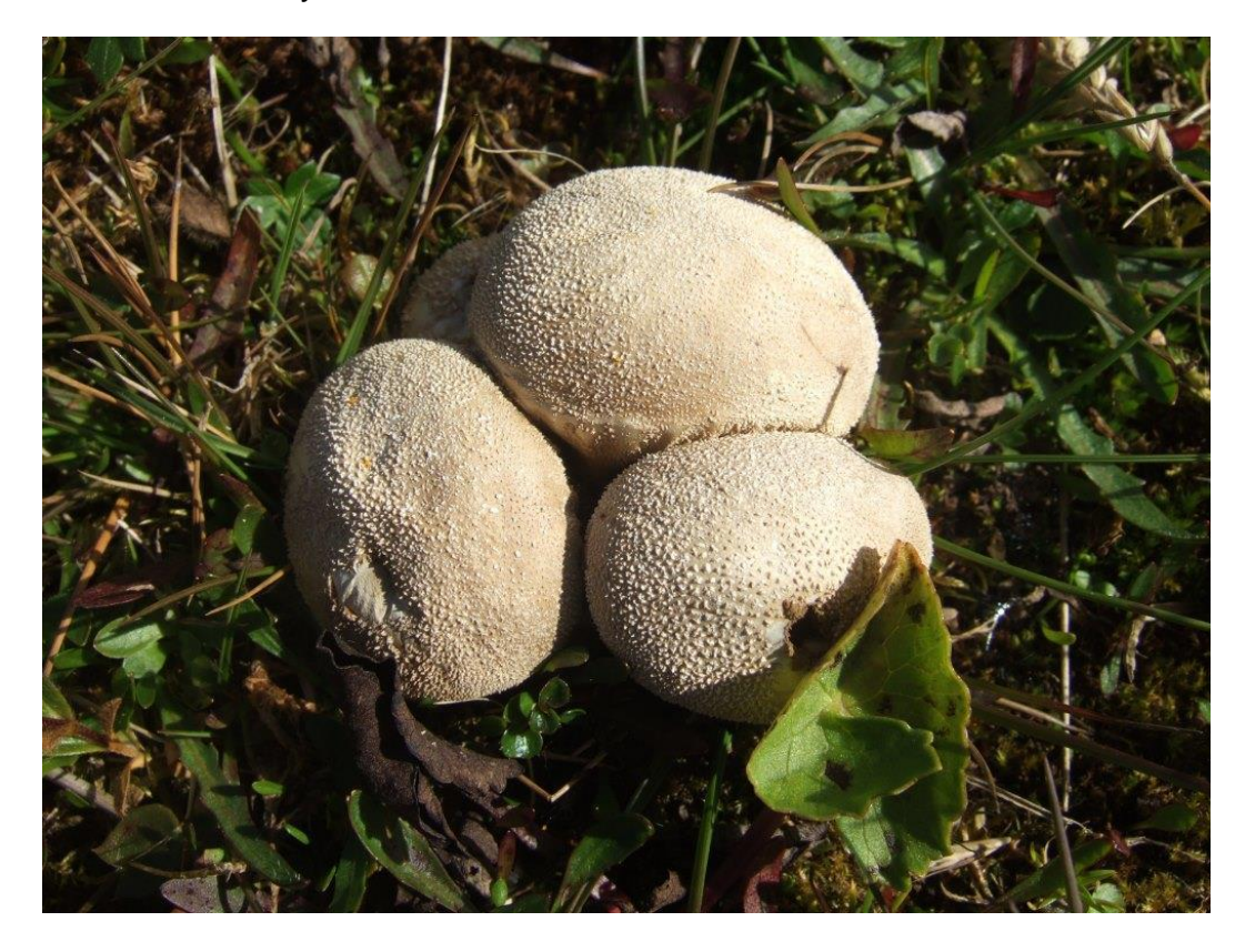
Puffballs

The Orkney Wildlife Information and Records Centre is based in the Orkney Library and Archive, on Kirkwall's Junction Road and provides vital support for biodiversity action planning. Established in 1998, the Centre provides a repository for the collection and dissemination of information relating to Orkney's natural heritage. Data on the County's habitats and species has been recorded over many years, both by voluntary recorders and by other organisations with an interest in the natural environment of Orkney.