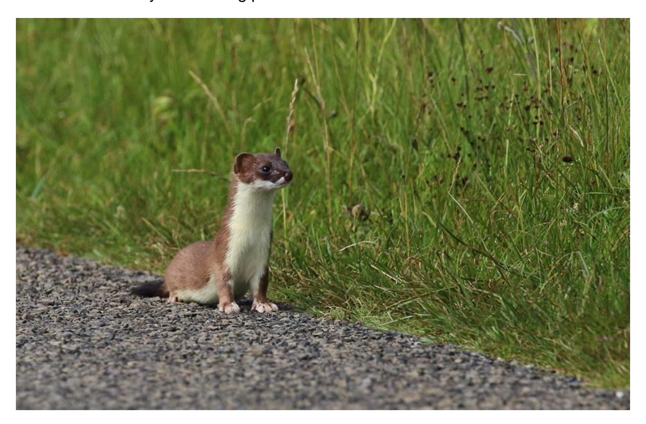
A Stoat in Orkney

In 2014 Scottish Natural Heritage (SNH) commissioned a report<sup>4</sup>, to consider the possible effects of the stoat population on Orkney's native species. The report recommended that removal of the stoat population is the best option to safeguard Orkney's wildlife. As a result, the Orkney Native Wildlife Project (ONWP) has been established, led in partnership by SNH and the Royal Society for the Protection of Birds Scotland (RSPB), and with the generous support of the National Lottery through the Heritage Lottery Fund. In 2017 Orkney Islands Council (OIC) agreed to be a non-financially contributing partner.