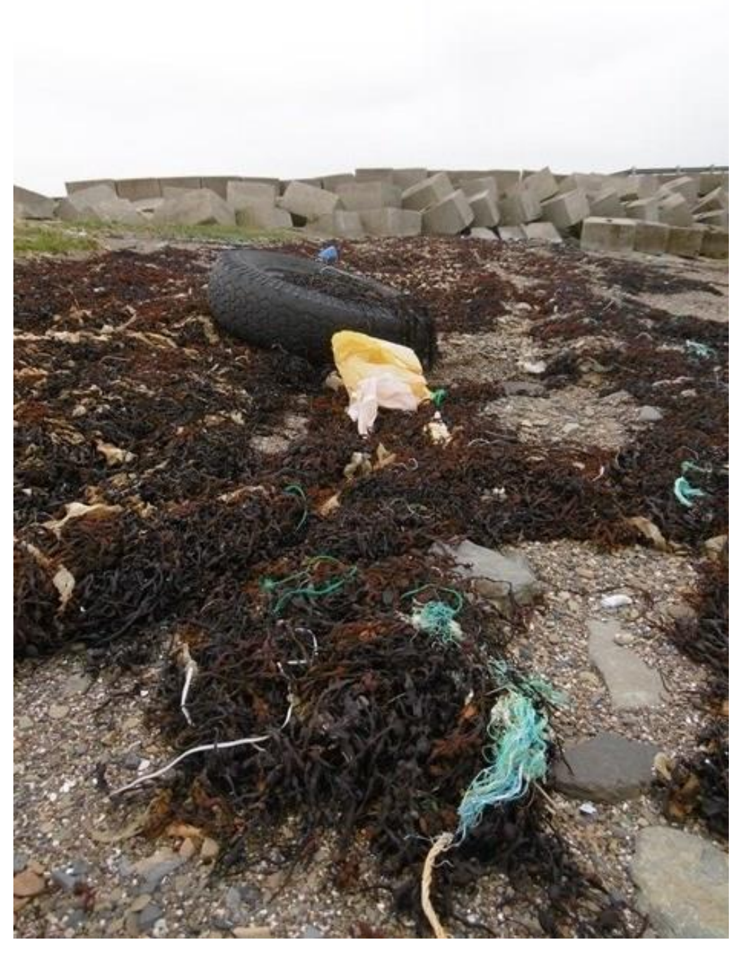
Marine Litter at No. 1 barrier

Plastic waste accounts for a large percentage of marine litter and causes harm to marine life in several ways. It can cause entanglement and drowning, or animals may eat it mistaking it for their usual prey species. Puffins, Fratercula arctica , have been recorded feeding plastic to their chicks.