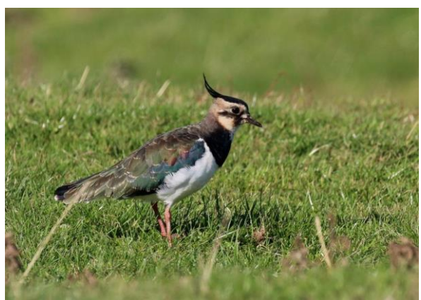
Curlew and Lapwing

Natural and semi-natural habitats are an integral component of Orkney's more intensively managed landscapes, where they help maintain ecosystem services such as pollination, water purification, pollution filtration, water storage and regulation, carbon storage and coastal protection. They are often managed through agrienvironment schemes to benefit biodiversity.