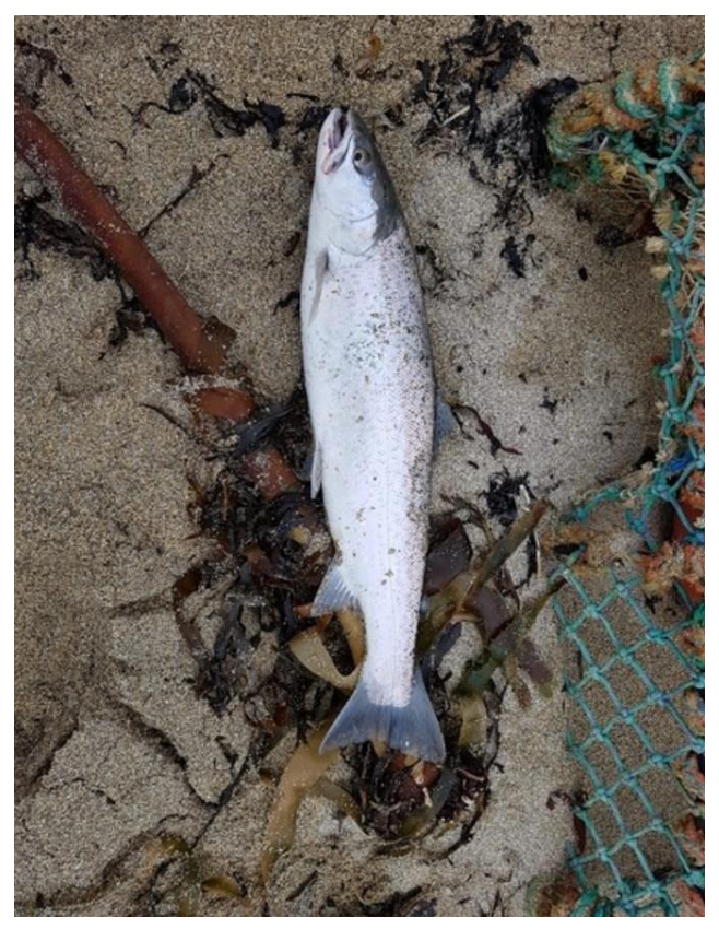
Sea Trout

The Sea trout, Salmo trutta, is an anadromous species, i.e. fish are born in freshwater, then migrate to the sea as juveniles where they grow into adults before migrating back to freshwater to spawn. It is the migratory form of the fresh water Brown trout. In the British Isles this species can grow up to about 1m in length and over 10kg in weight; however individual sizes vary widely between populations. As juvenile fish, they are characterised by the presence of red or orange spots on their flank, mostly above the lateral line. Those fish destined to become Sea trout change their colouration to silver as they prepare for downstream migration and during spring they enter the sea as silvery smolts. Some of these return to spawn in fresh water as mature adults between May and November of their first year at sea, whilst others return to overwinter in fresh water as juveniles, also known as 'finnock', and may not spawn at this time. These fish return to the sea, coming back to the burns to spawn in subsequent years. Spawning occurs in late autumn and many Sea trout will spawn several times during their lifetime. On their return to the rivers and burns they gradually darken to a reddish brown and male fish develop a hook or 'kype' on their lower jaws.