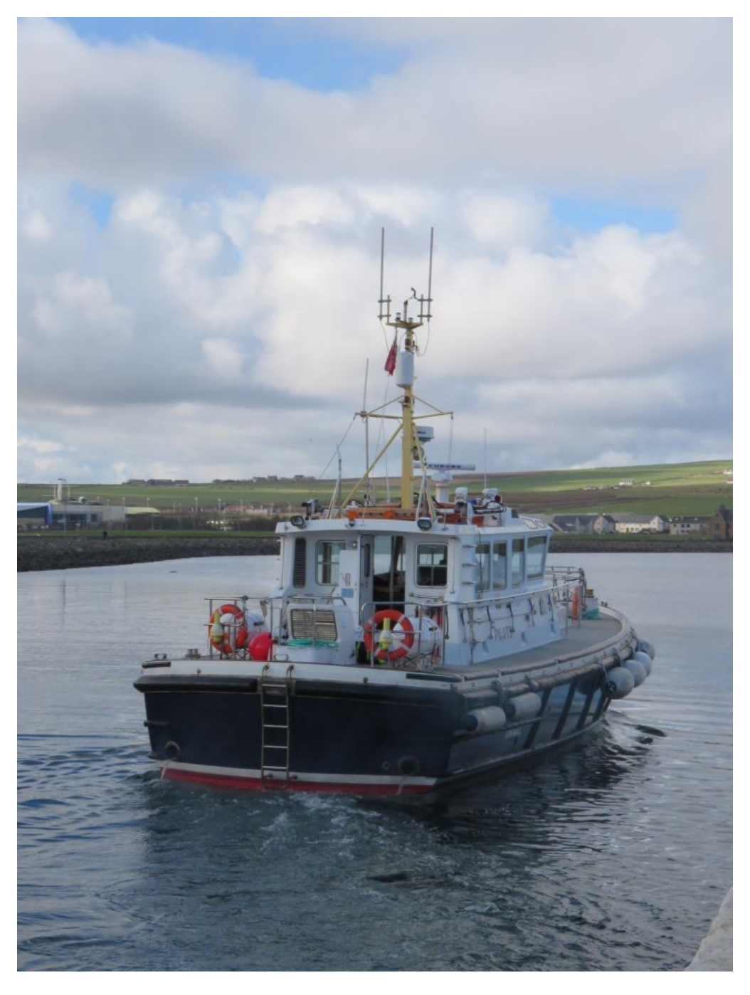
OIC Pilot Launch