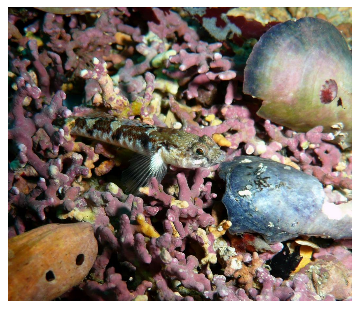
Goby on Maerl

Maerl is a collective term for several species of red seaweed, with hard, chalky skeletons. These form loose subtidal accumulations on the surface of soft sediments. In Orkney two species of red algae form maerl beds: Phymatolithon calcareum and Lithothamnion glaciale . Unlike most other seaweeds, maerl grows as unattached, rounded nodules or short, branched shapes on the seabed. However, in common with all seaweeds, maerl needs sunlight to grow; therefore, it typically occurs in shallow seas at depths of up to 30m. In favourable conditions maerl can form large and deep beds, i.e. in a fast, tidal flow or where wave action is sufficient to remove fine sediments, but not strong enough to break the brittle maerl branches. Within these beds, layers of dead maerl build up, topped by a thin layer of pink, living maerl.