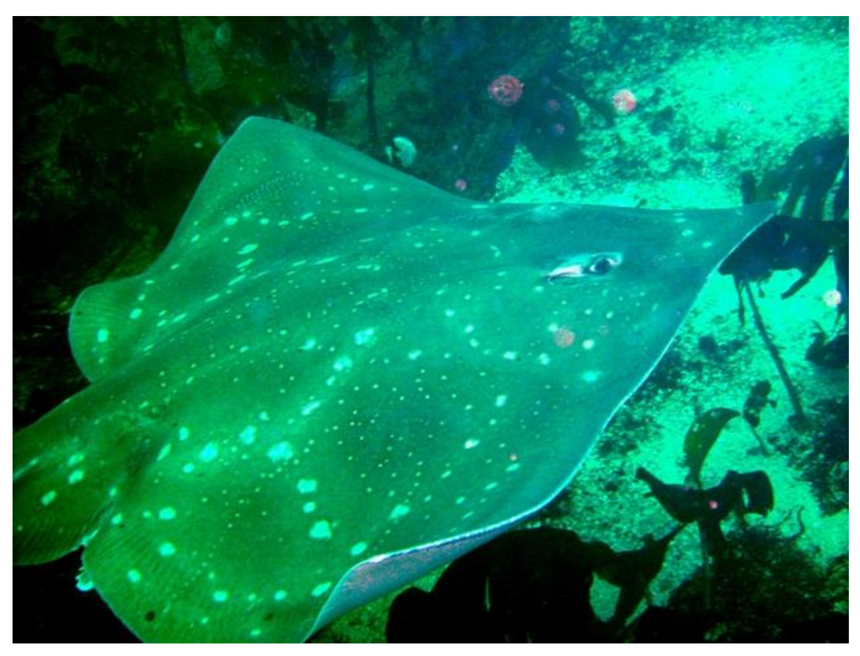
Flapper Skate

The Flapper skate is the largest skate in European waters and can grow up to 3m in length. It has a long, pointed snout and its upper side is brownish green with lighter spots (although not all specimens have these). There is a row of 12-18 thorns along the tail. Young skate have a black underside which fades to paler grey or cream as the fish ages. The pelvic fins in males are modified to create claspers for the transfer of sperm. Like sharks, the skate is an elasmobranch (a cartilaginous fish) and has no swim bladder; instead the fish maintains buoyancy with large livers, rich in oil.