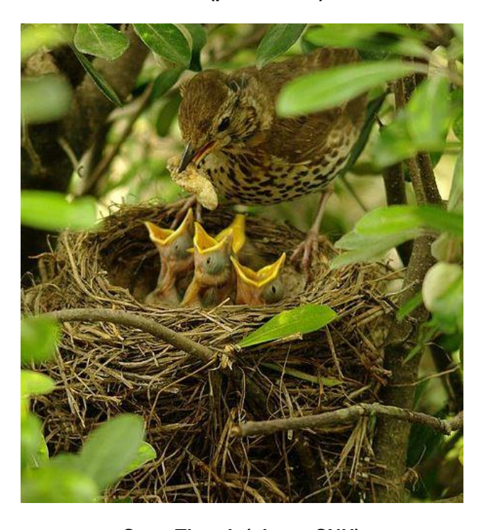
Song Thrush