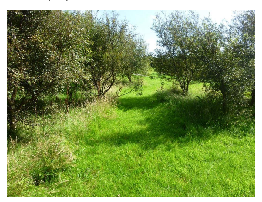
Trees at Muddiesdale, Kirkwall

Towns and smaller settlements include public 'parkland' and grassed areas that are managed and maintained by Orkney Islands Council (OIC). These areas have largely been designed and maintained without thought as to how they could contribute to biodiversity objectives.