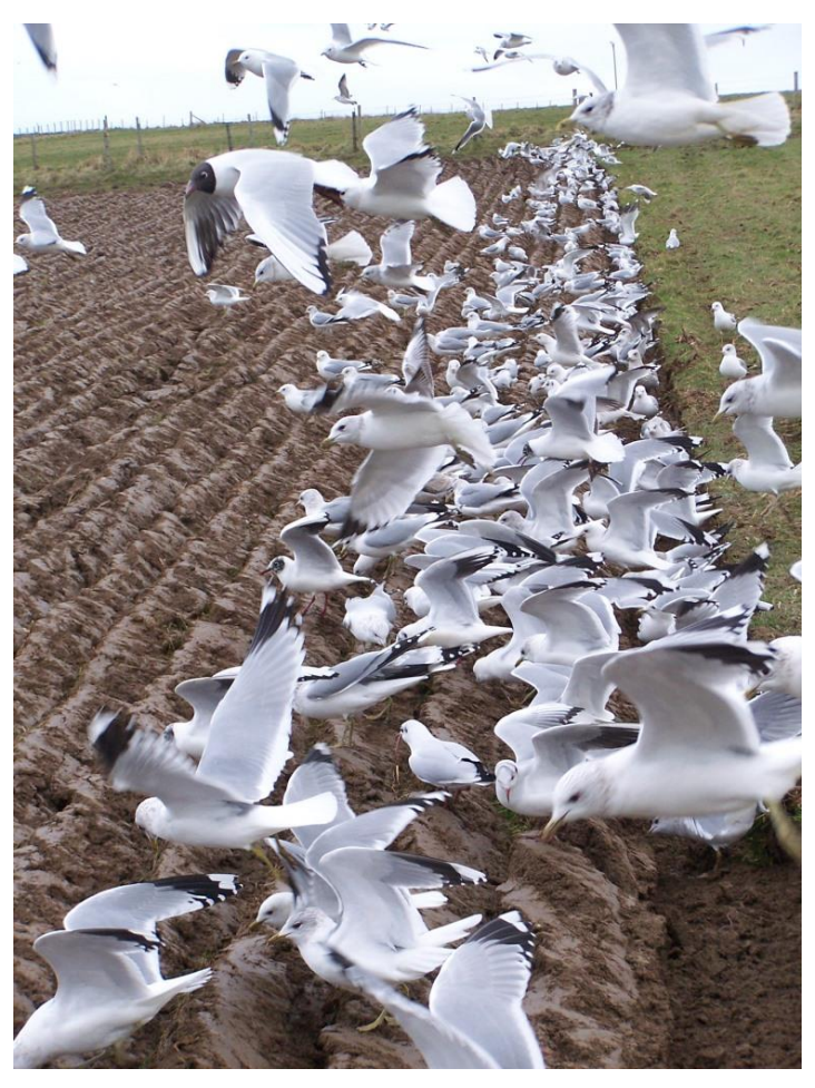
Gulls following the plough

The current SRDP will include at least one more round of AECS applications and five years funding will then be available, going forward. Following the United Kingdom's exit from the European Union, the long-term future of agricultural support payments remains uncertain.