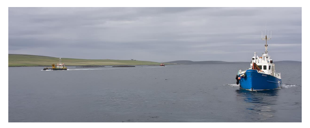
Fish Farm and other Marine activity

Increasing numbers of people work in Orkney's marine environment, e.g. in the inshore fishing, aquaculture and marine renewables industries, and they are well placed to record sightings of marine species and their behavioural traits.