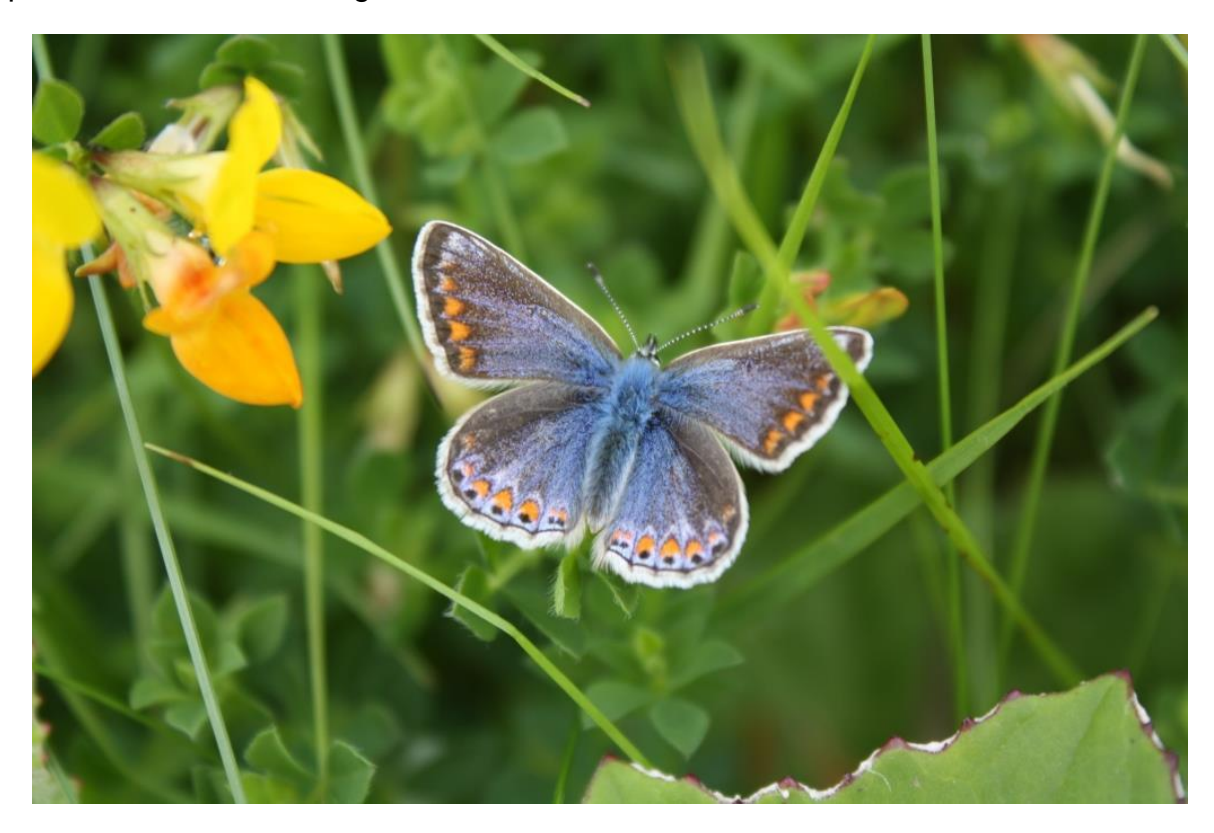
Common Blue Butterfly

Biodiversity is inexorably linked to sustainable development, and a rich biodiversity is generally associated with healthy environments. To ensure the survival of our habitats and species, and to pass down a heathy stock of natural assets for future generations, we must accept that we play a defining role in the sustainability and health of our islands. Therefore, we should all afford respect and protection to wildlife, along with the natural landscapes within which we live. It's important that we conserve the habitats and species that are rare or under threat, but equally we should appreciate the value of other, more commonplace biodiversity, and ensure its protection so that future generations can continue to benefit from it.