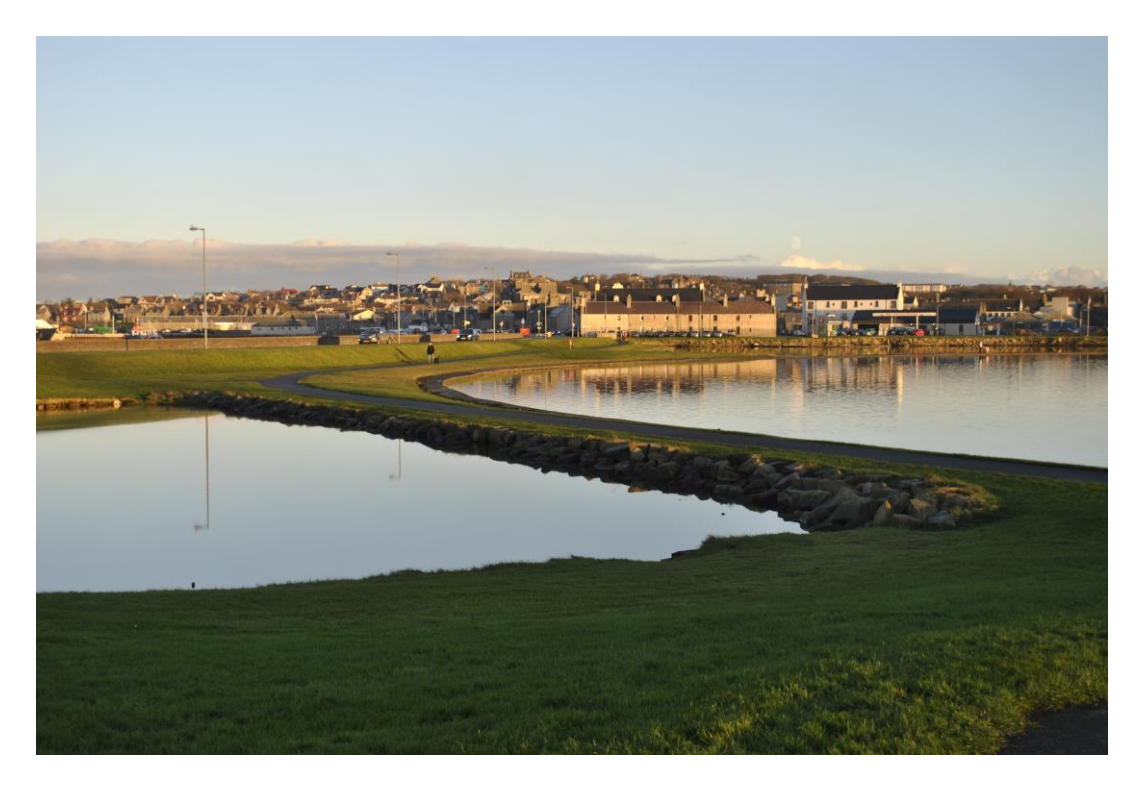
The Peedie Sea, Kirkwall

Further information on this habitat and the species it supports is included in the Built-up areas and gardens Habitat Action Plan (HAP) in the original Orkney LBAP (2002) which is available on the Council's website.