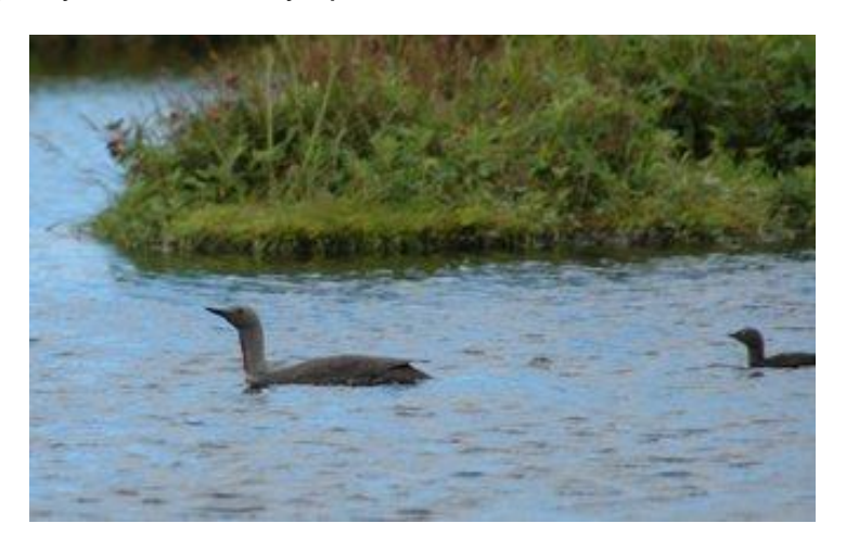
Red-throated Diver

Key features of Orkney's bog landscape are the many bog pools and lochans which provide nesting sites for Red-throated diver, Gavia stellata and also support a number of dragonfly and damselfly species.