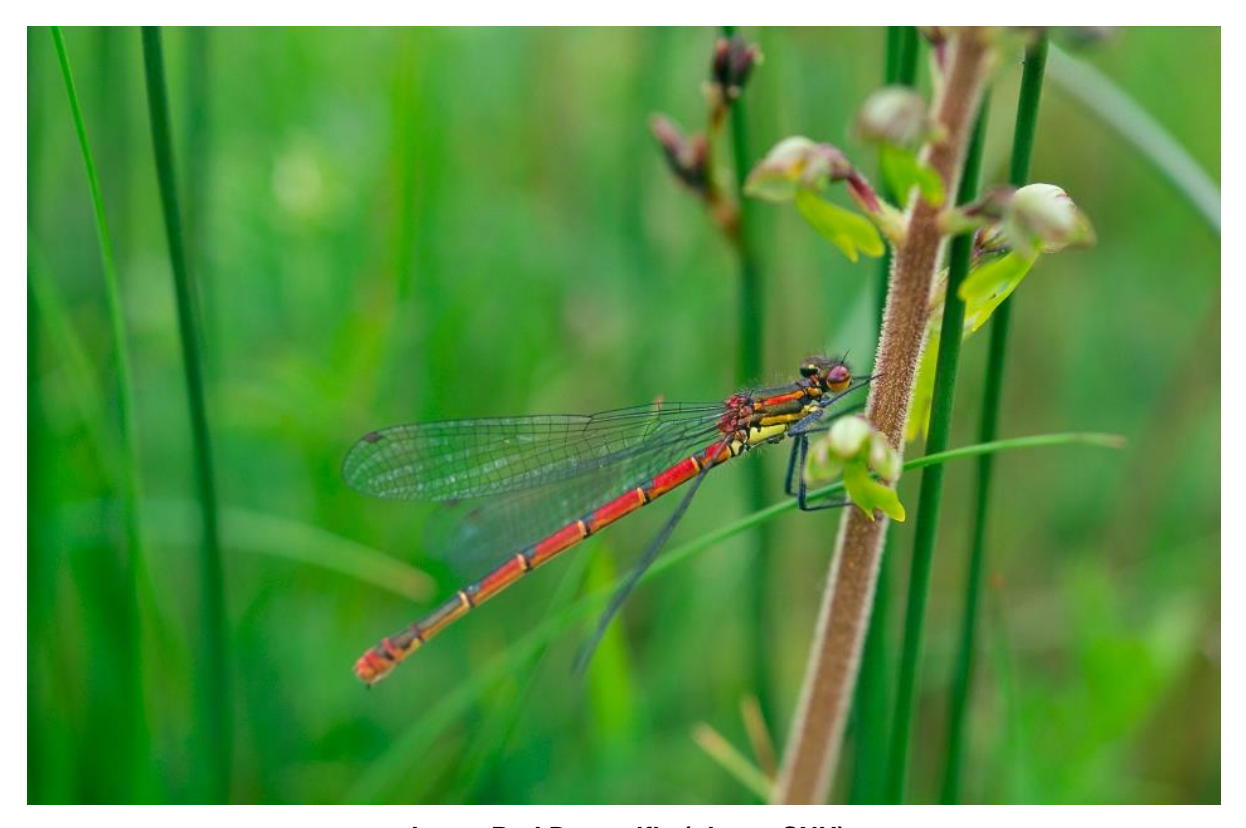
Large Red Damselfly

Keynote species: Hen harrier, Circus cyaneus ; Short-eared owl, Asio flammeus ; Golden plover, Pluvialis apricaria ; Red-throated diver, Gavia stellata , Large heath butterfly, Coenonympha tullia ; Heath carder bee, Bombus muscorum , Lichens; Sphagnum mosses; Orchids; Dragonflies and Damselflies.