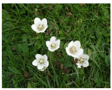
Orkney Vole, Skylark and Grass of Parnassus