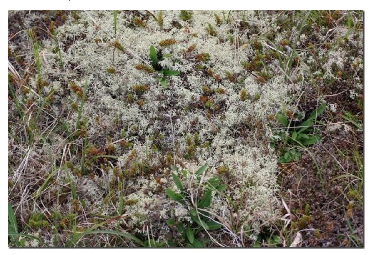
Lichen in heathland

bryophyte interest. Nitrogen deposition can increase the likelihood of insect defoliation of upland heathland.