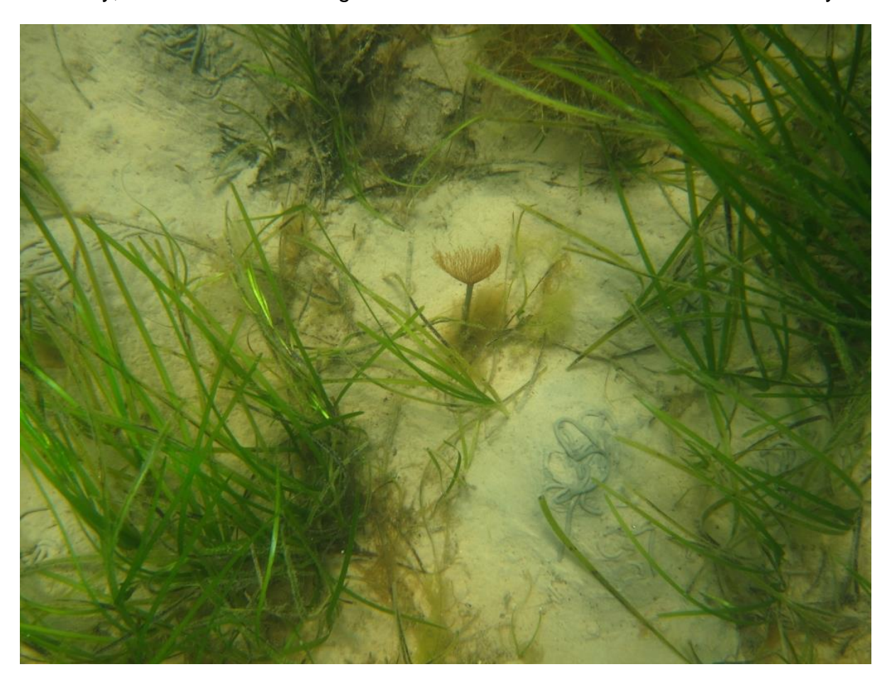
Widewall Seagrass with Peacock worm and Lugworm casts

Seagrasses, Zostera spp. are marine flowering plants but they are not actually grasses. They are found in shallow coastal areas around the world, in areas that are afforded at least some shelter from wave action, for example sea lochs, inlets, bays, sounds and lagoons. They occur on sands, mud and gravel, on the lower shore and subtidally, down to 10m in a range of tidal conditions and in full or variable salinity.