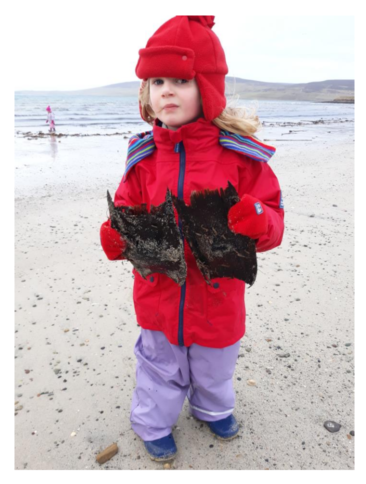
Egg Cases found in Evie