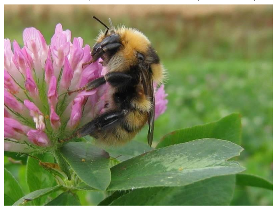
Great Yellow Bumblebee

Destruction of bees' and wasps' nests, whether deliberately or accidentally;