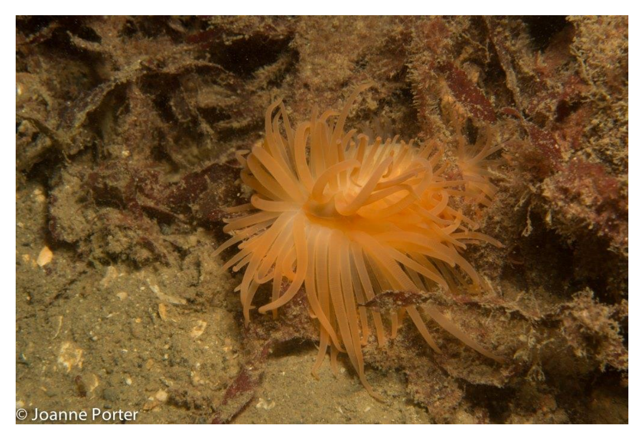
Flame Shell

Flame shells, Limaria hians , are bivalve molluscs with thin oval shells, usually about 2.5 cm in length but occasionally reaching 4 cm. The shell is white in young specimens, becoming whitish-brown with age and has a wavy margin. The edge of the fleshy mantle bears numerous conspicuous red and orange filamentous tentacles which resemble flames. Also known as gaping file shells, they live on the seabed inside nests which they build by weaving together tough threads (byssus) with surrounding materials such as seaweed, maerl, stones and shells. Adjoining nests coalesce to form larger structures containing multiple flame shells. These structures create a habitat that stabilises the sediment and provides an attachment surface for many other organisms including hydroids, bryozoans, ascidians, kelps and seaweeds, as well as scallop spat as it settles from the plankton. A rich diversity of fauna is also found within and below the flame shell bed. This diverse assemblage of organisms adds to the habitat's complexity and provides shelter and feeding grounds for species such as cod and saithe.