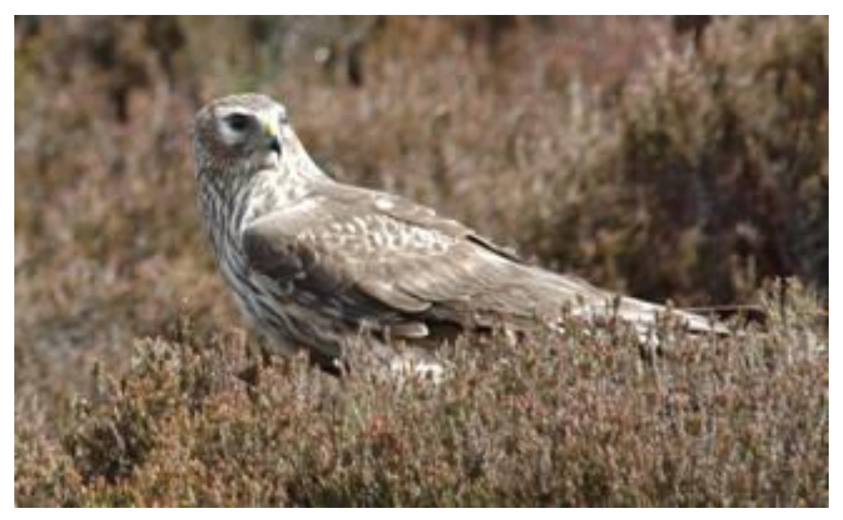
Female Hen Harrier

Orkney is a vital stronghold for Hen harrier, with an estimated 83 breeding pairs in 2016. While Hen harriers are declining in other parts of the UK, the Orkney population is remaining stable.