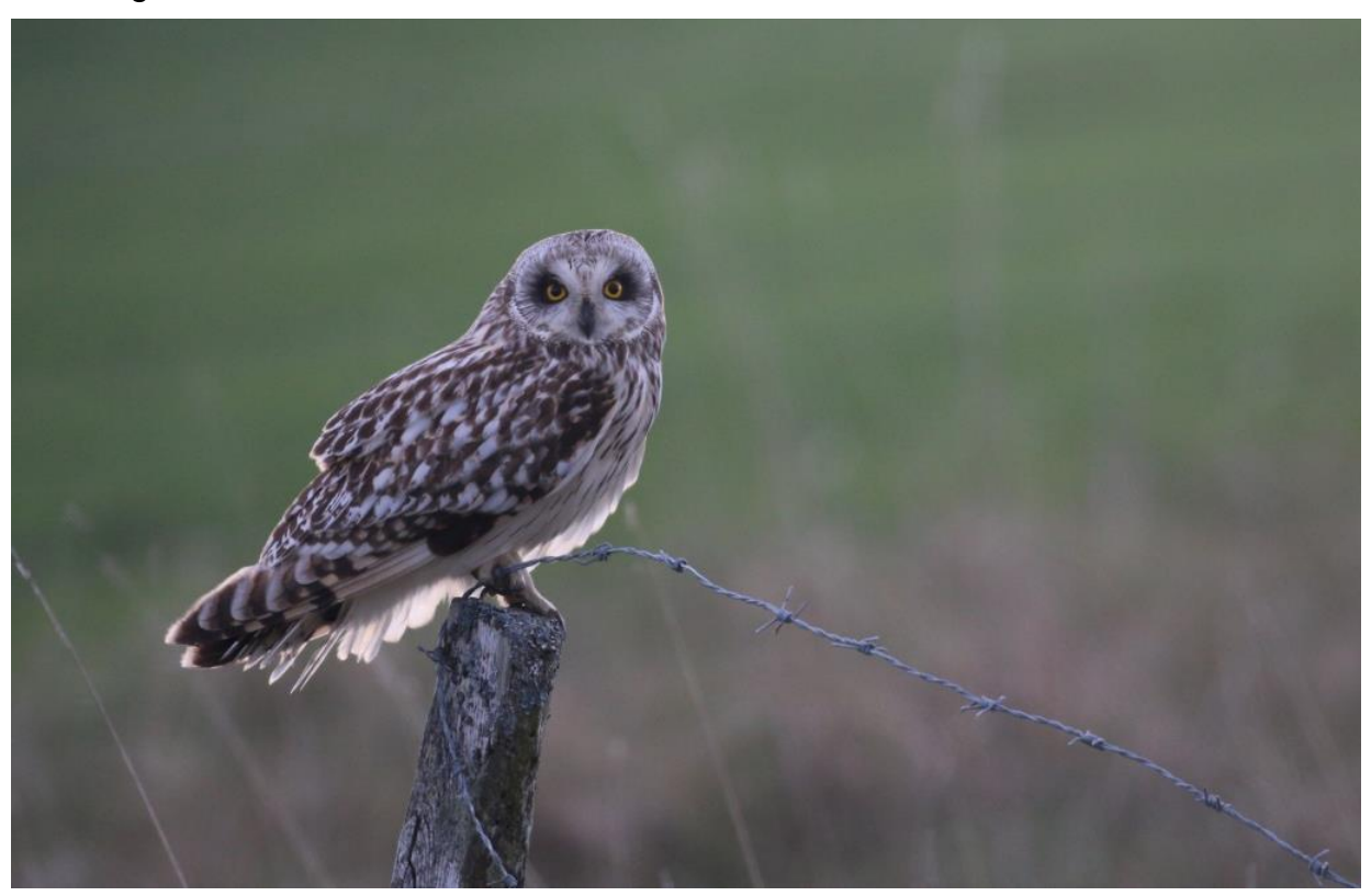
Short-eared Owl

Peatlands are important storage facilities for carbon; they also help regulate water storage and run-off, as well as providing water purification through filtration. The many tracks through Orkney's 'peat hills' offer access for hill-walking and bird-watching.