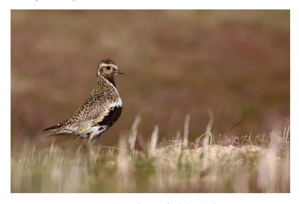
Golden Plover

Peatland habitats support a wide range of species and, for some of these, the Orkney populations are of national, or even international importance. Three of our key upland bird species are Hen harrier, Circus cyaneus Short-eared owl, Asio flammeus , and Red-throated diver. The importance of the Orkney populations of these species is apparent in designations such as the Orkney Mainland Moors Special Protection Area (SPA) which covers much of the moorlands of the west mainland and provides protection for these birds at an international level.